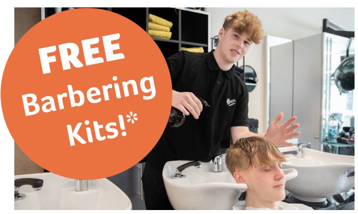
Subject to terms and conditions

Exposure to employers is also an integral part of this programme – we'll seek to ensure that you have opportunities to gain real-word experience of your sector, giving you the qualifications and experience to progress!